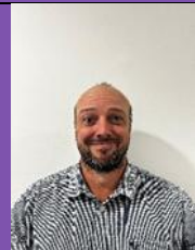
Will - RSW Will works covering day and evening shifts and every other weekend.