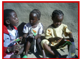
Finest; three of the lucky girls who will be receiving these bags.